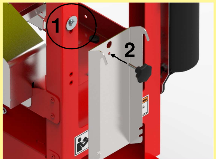
Figure 1: Installation of the calibration slide on the frame

Then hook the calibration slide (A) onto the bolt and fasten it onto the frame with the star knob screw (B).